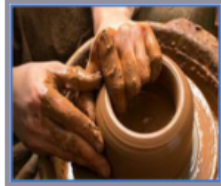
Artisans, Industry & Livelihood