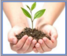
Sustainable Agriculture System