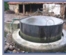
Rural Energy Systems