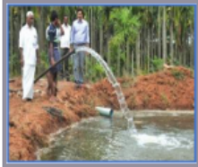
Water Resource Management