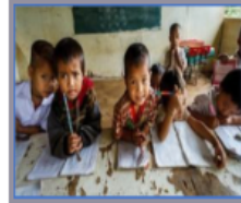
Basic Amenities (School Education, Digital Education, Infrastructure, Others)