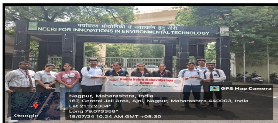
Visit to NEERI

To promote hands-on learning, the department facilitated several field visits, including educational trips to the Bhandewadi Dumping Site, Bhandewadi Wastewater Treatment Plant, NEERI, the Central Institute for Cotton Research (CICR), ICAR institutes, and a biodiversity study tour to Chikhaldara. These visits provided students with practical exposure to waste management systems, environmental research methodologies, and ecosystem diversity.