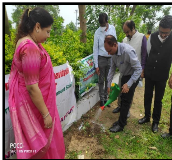
Tree Plantation GW CET, Chikna, Nagpur