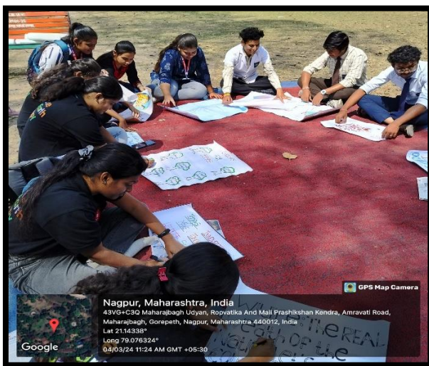
Poster Competition at Maharajbagh Zoo, Nagpur

During the session, the department organized a wide array of co-curricular and outreach activities to foster student engagement and environmental consciousness. Poster and essay competitions were conducted on major environmental themes, including a Poster Competition on Save the Tiger, an Essay Competition on ‘Partnership for Conservation’, a Quiz Competition on World Wetlands Day, a Poster Competition on World Wildlife Day, an Essay Competition on World Environment Day, and a Group Discussion on World Water Day. These activities encouraged critical thinking, creativity, and environmental responsibility among students.