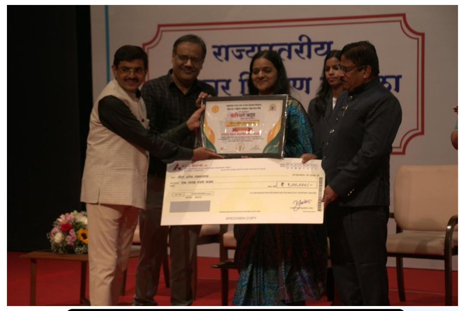
Center of Excellence Award