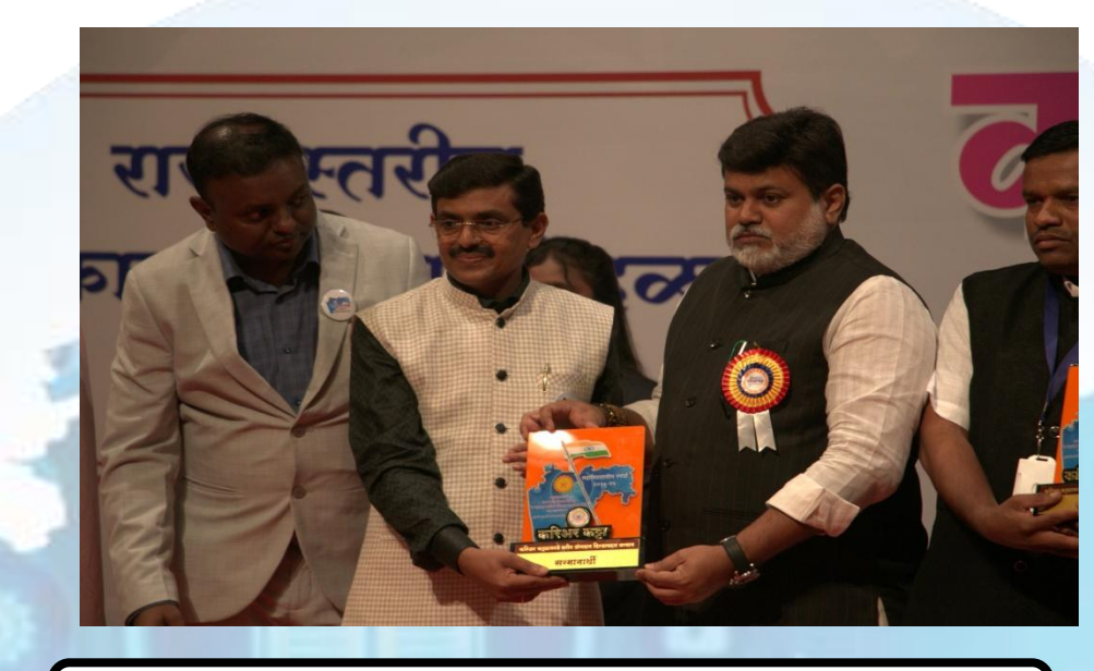
1<sup>st</sup> Rank in Excellent State Level Coordinator Award