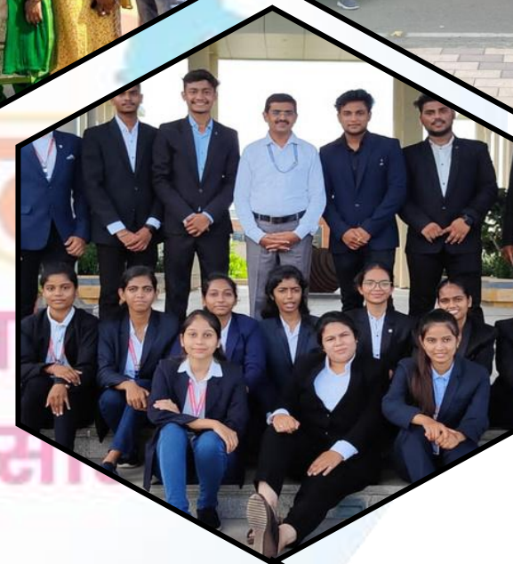
IIM Incubation Centre