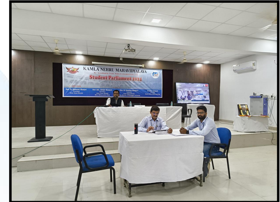
Student Parliament 2024