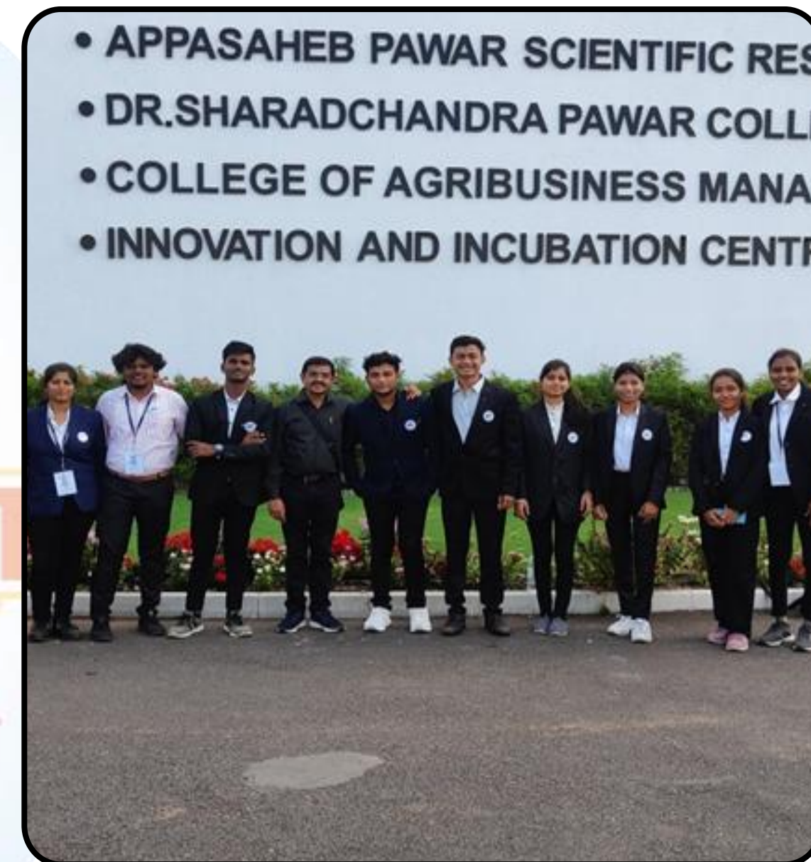
Atal Incubation center, Baramati