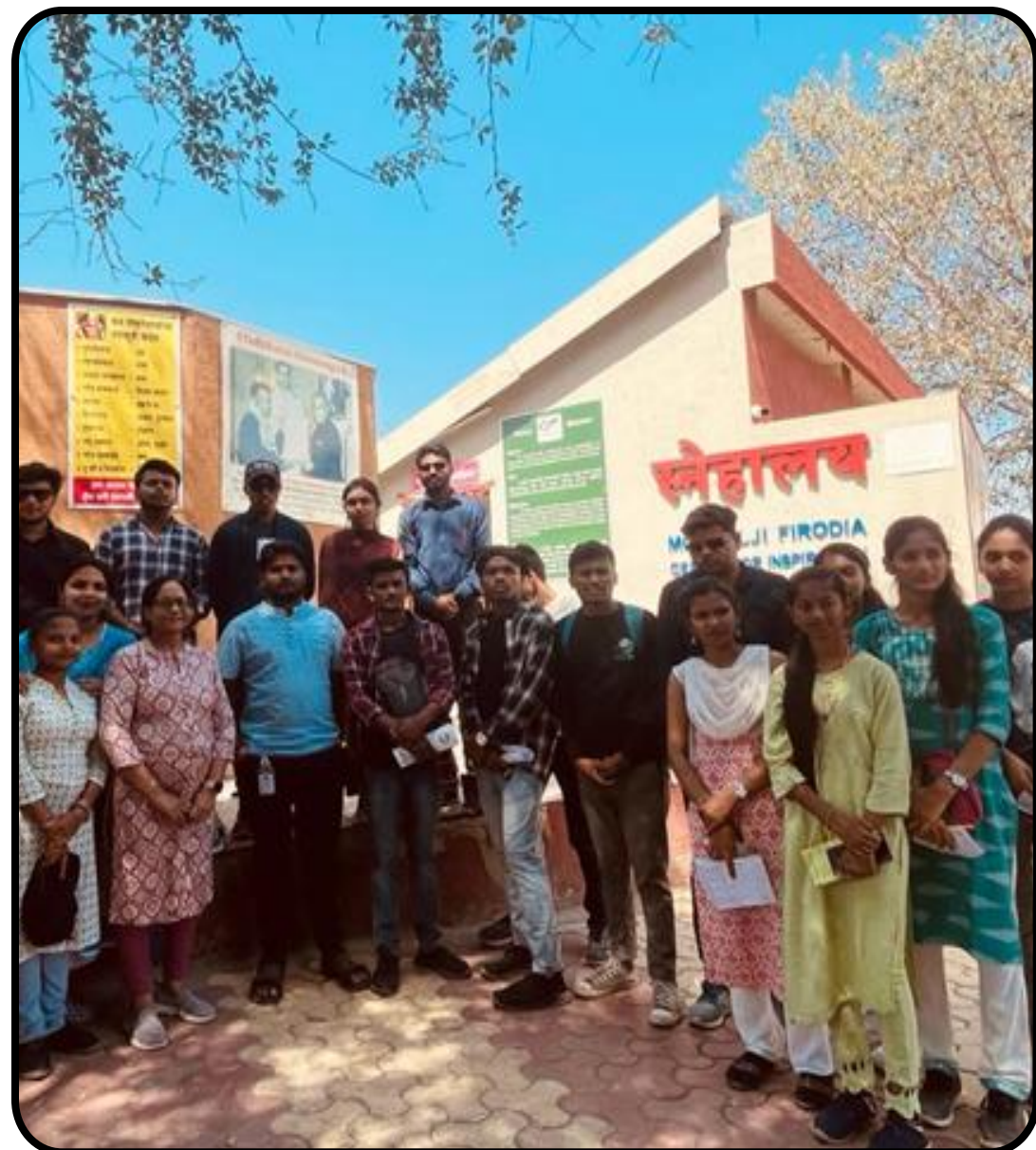
Snehalaya NGO, Aurangabad