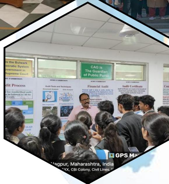
Old Secretariat Nagpur