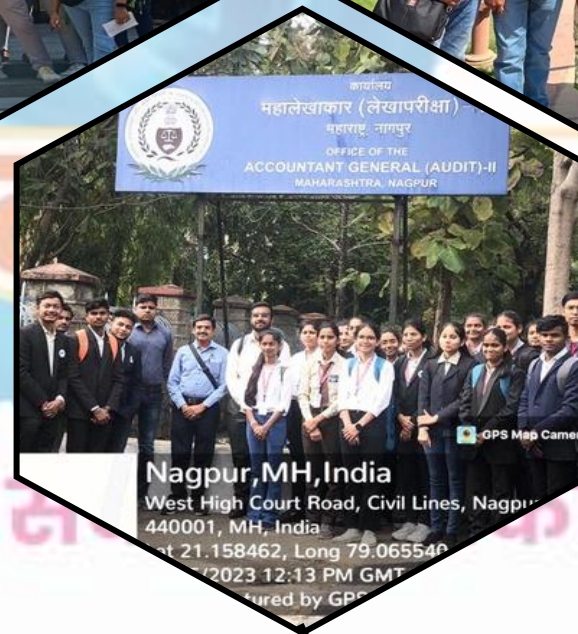
Accountant General Office