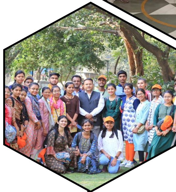
Doordarshan, New Delhi