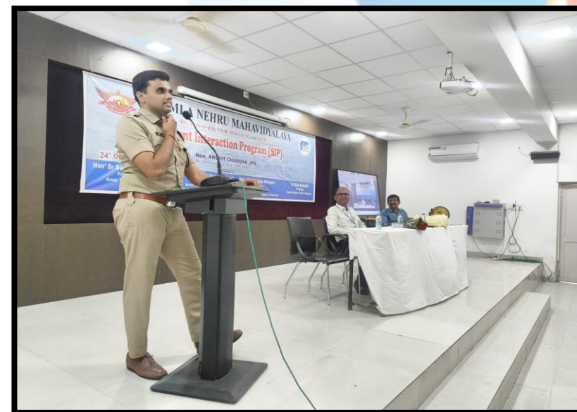
Hon. Archit Chandak, IPS, DCP(Traffic), Nagpur